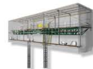
4.3 m (14') Motorized unit