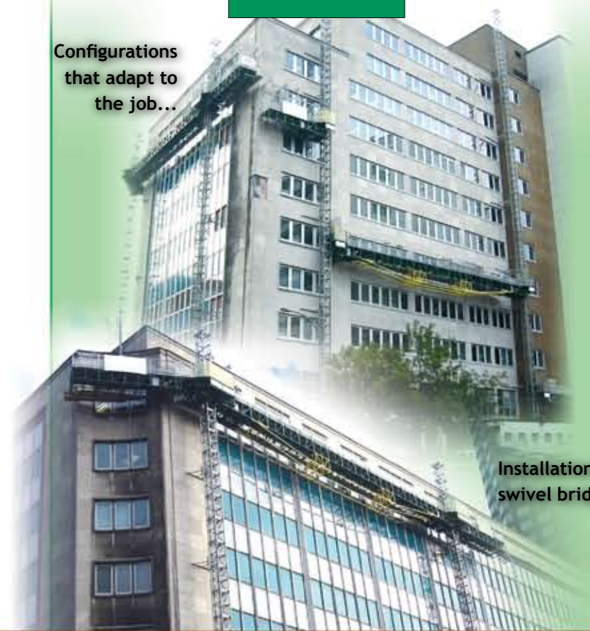
Installation with swivel bridge