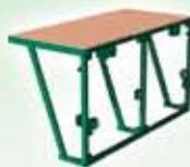
HFBG-BEA Support bridge

Twin motorized units: Configuration of 3 m (10') to 24 m (79'), lifting capacity of up to 4 536 kg (10 000 lbs)